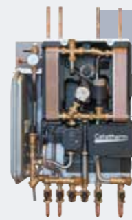
Heat Interface Units (HIUs)