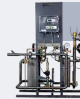
District Heating & Cooling Substations