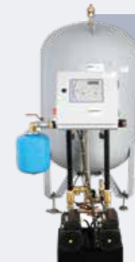
Hydraulic Expansion Systems