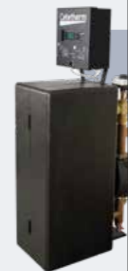
Tap Water Systems